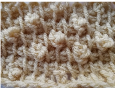
Diagram and Sample: